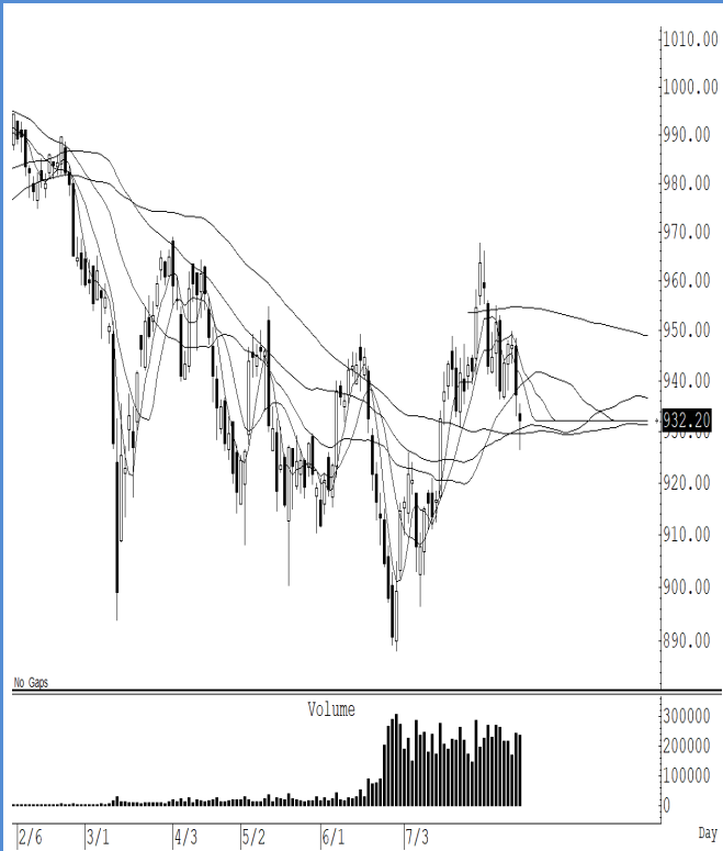
S50U23 (Close 932.20 Chg -5.0)